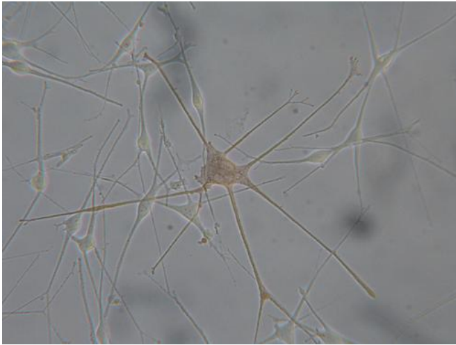
Primary culture of human melanocytes.

19 February 2014, by Komunikazio Bulegoa