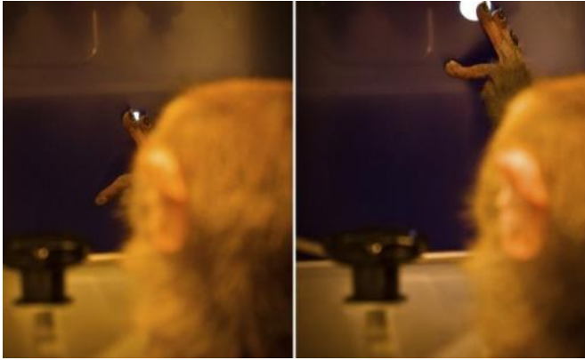
A rhesus macaque ( macaca mulatta) during a neuroscientific test at the DPZ.