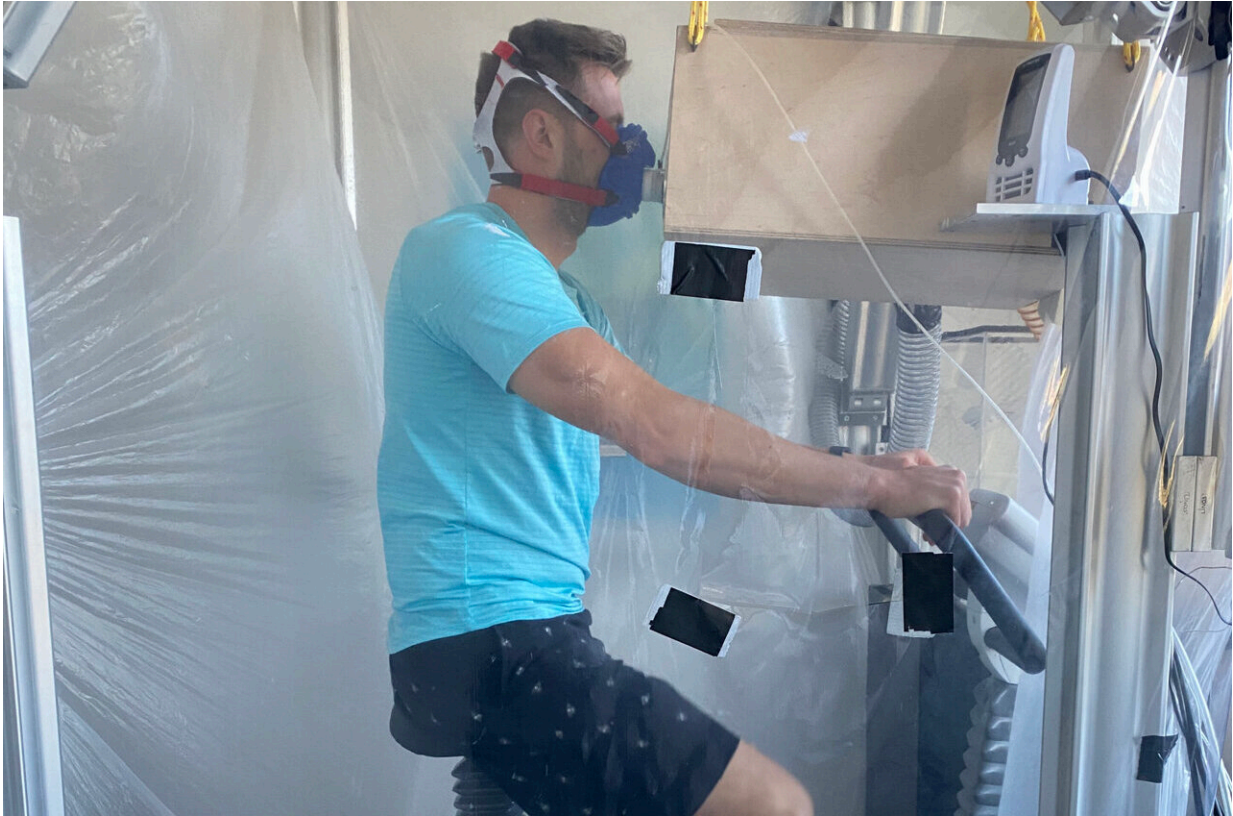
A study participant in a clean air space.

The volunteers were separated into three groups: One did a simple resistance exercise, another engaged in a more difficult three-set resistance workout, and the third participated in a spin class.