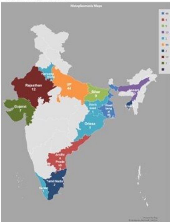
A Epidemiology Maps for Histoplasmosis According to Statehood of Patients