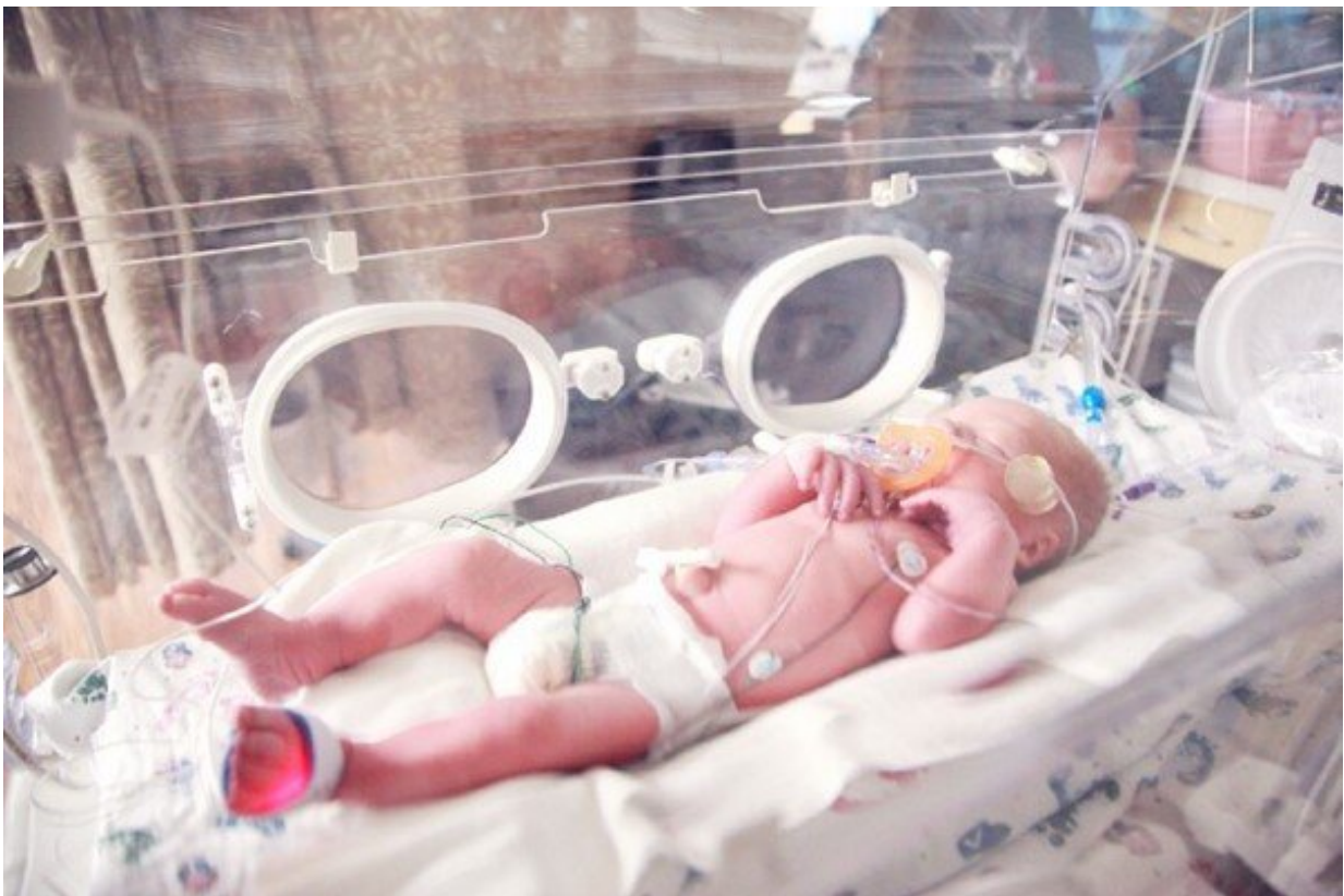
Ventilated infant.