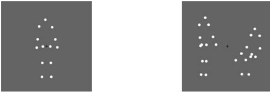
Fig 1. A "second-person" perspective social interaction and a "third-person" perspective social interaction.

Humans are endowed with intrinsic social motivation to interact with others and to maintain social relationships. It has been demonstrated that pupil size may serve as a window for personal motivations, such as sex, money and etc. However, to date, it remains elusive regarding whether pupil size gains an insight into social motivation, in particular social interaction.