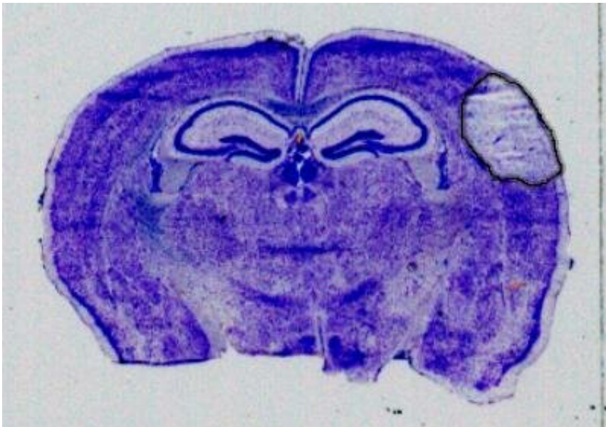
The size of a stroke in the brain of a mouse with treatment by Gap 19.